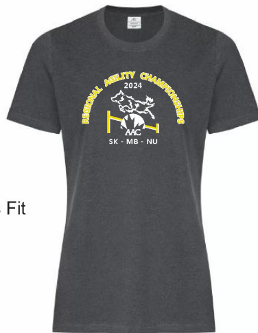
Dark Heather Grey**