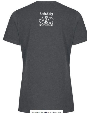
Dark Heather Grey**